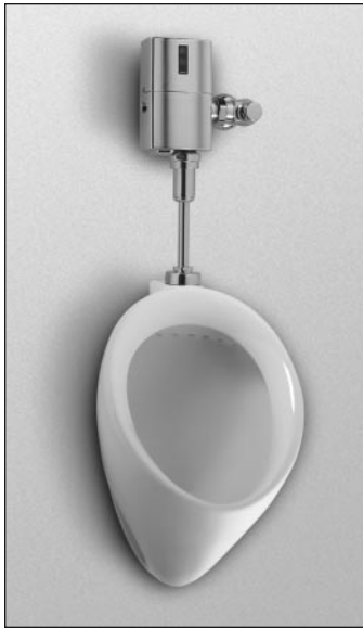
UT104E Top Spud Urinal TEU1LN12#CP 0.5GPF Eco EFV