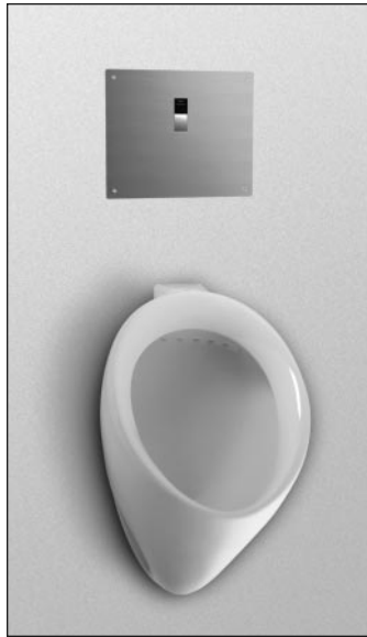
UT104EV Back Spud Urinal TEU2LN11#SS 0.5GPF Eco EFV (flush valve will launch second half of 2008)