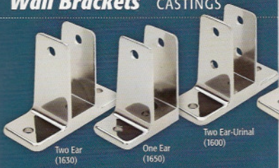
Two Ear (1630)