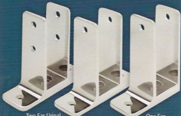
Two Ear Urinal (X-High) (1330)