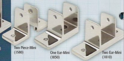
Two Piece-Mini (1580)