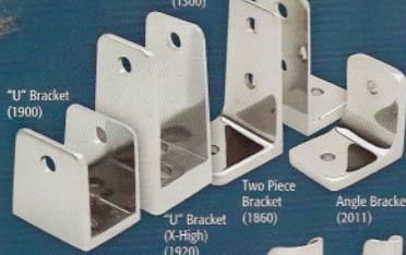
"U" Bracket (1900)